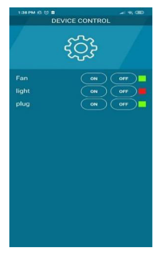
Fig 3. Device Control

1. Device Control: On selecting active devices the user is sent to a page where all devices that are connected to the system is displayed. There is color besides the button indicating the current status of the device (GREEN for ON, RED for OFF). When the user selects an option, the app sends data to the server via internet. The status of the device is updated and command send to the device to implement.