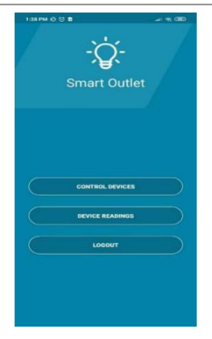
Fig. 2 Main Layout

1. Device Control: On selecting active devices the user is sent to a page where all devices that are connected to the system is displayed. There is color besides the button indicating the current status of the device (GREEN for ON, RED for OFF). When the user selects an option, the app sends data to the server via internet. The status of the device is updated and command send to the device to implement.